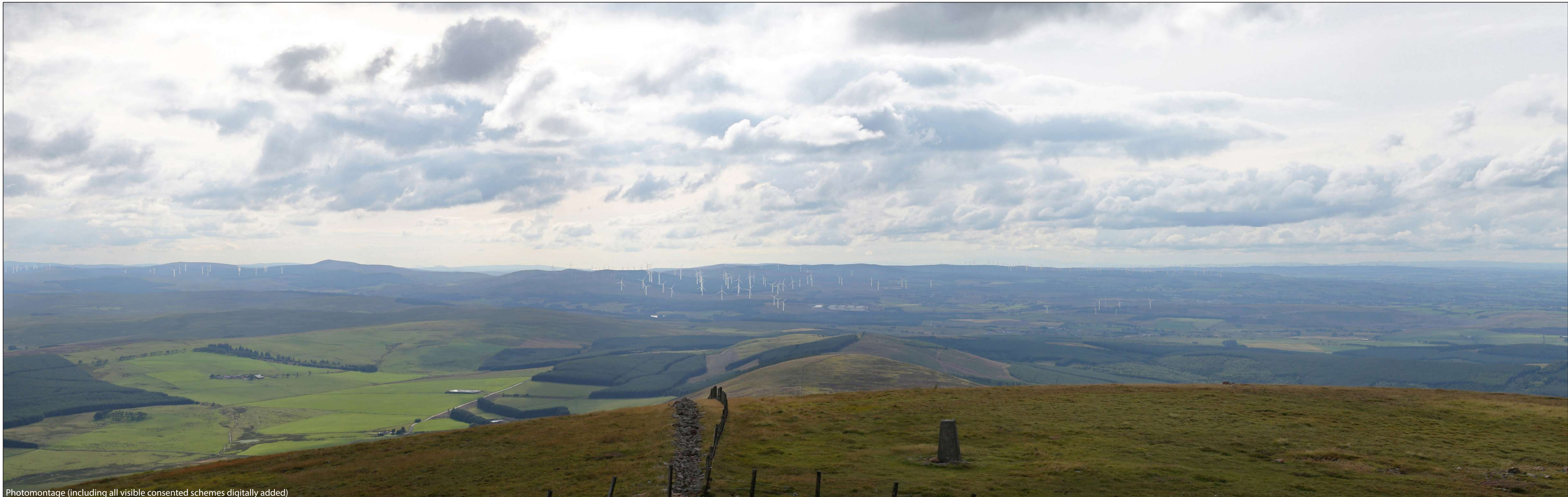
Photomontage (including all visible consented schemes digitally added)

Figure 6.39 (sheet D) Viewpoint 8: Tinto Hill DOUGLAS WEST WIND FARM EXTENSION