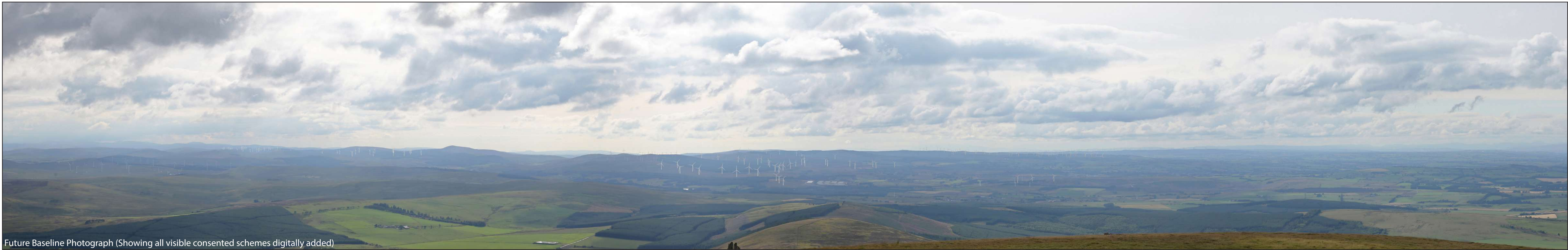
Future Baseline Photograph (Showing all visible consented schemes digitally added)